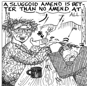
20 • The NA Way Magazine

Permission to reprint from this publication is granted to all Narcotics Anonymous service boards and committees, provided you cite the source. All other rights reserved.